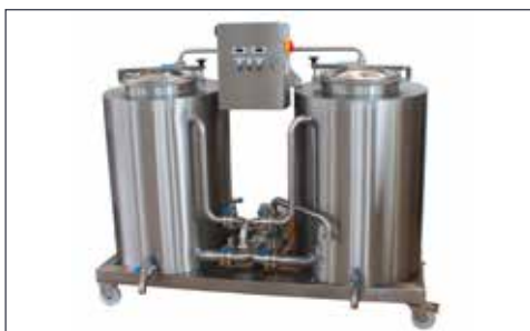
CIP-Installation (top left) Palletizer (top middle) loading a fully automatic keg machine for 90 keg per hour (top right)