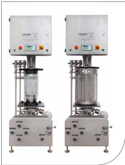
Semiautomatic keg machines, 15-50 kegs per hour

From a simple filling head up to combined filling- and cleaning semi- automats with a capacity up to 50 keg per hour