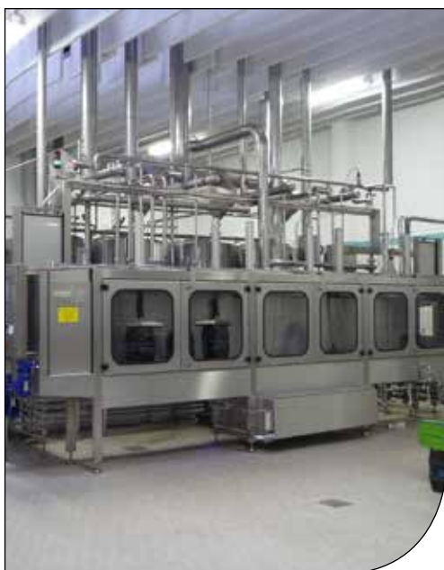
Fully automatic keg machines 50-300 kegs per hour

Our fully automatic filling and cleaning machine with a capacity up to 80 kegs/h in one line offers a quick and low-prize complete solution from filling until paletizing of all customary kegs.