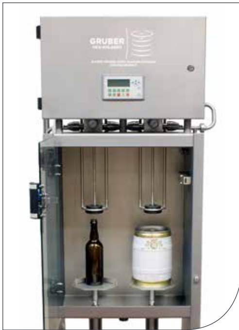
Semi automatic bottle- and party keg filler

Bottle filler, semi- and fully automatic, from 20-800 bottles/h