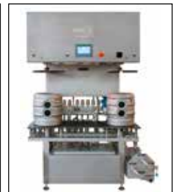
KombiKeg T Duo 45 Keg/h