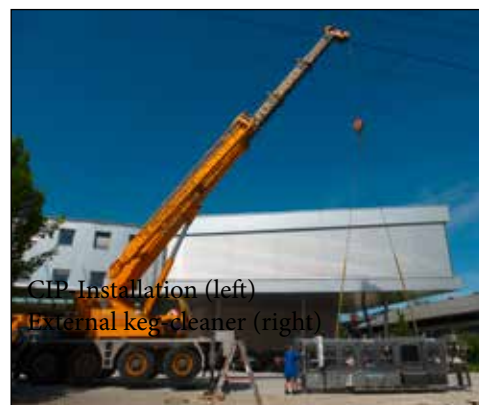
CIP-Installation (left) External keg-cleaner (right)