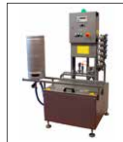
BabyKeg 20 Keg/h