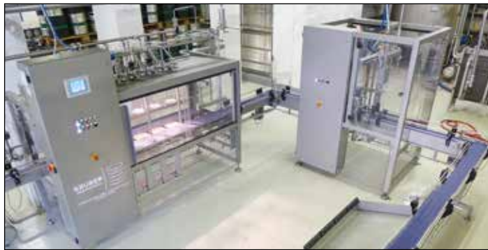
5l tin filling for max. 240 party kegs per hour