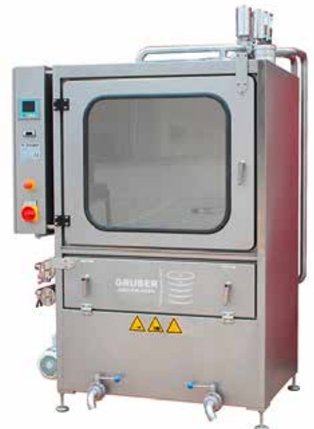
KRT Duo – Bottles and Kegs