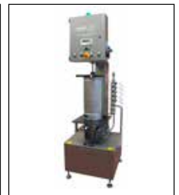
MiniKeg 30 Keg/h